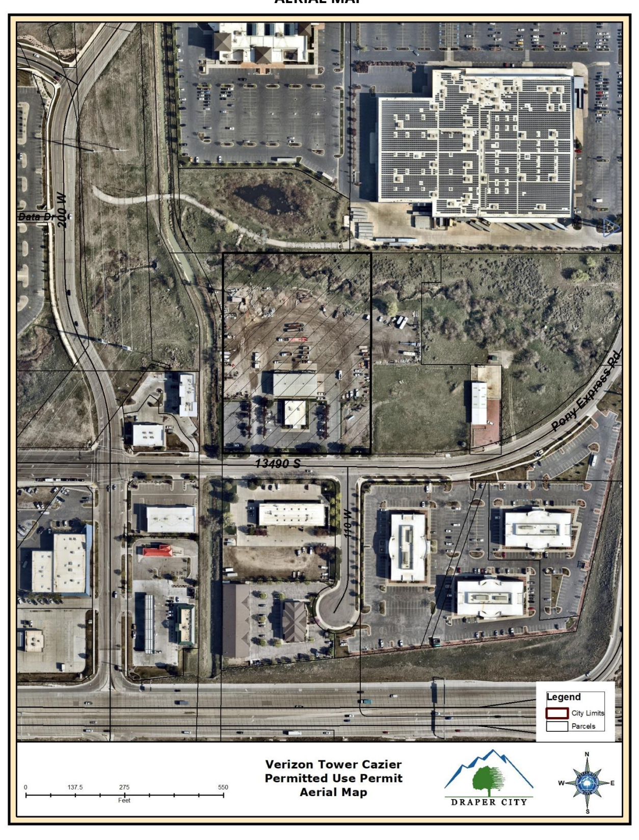
EXHIBIT B AERIAL MAP