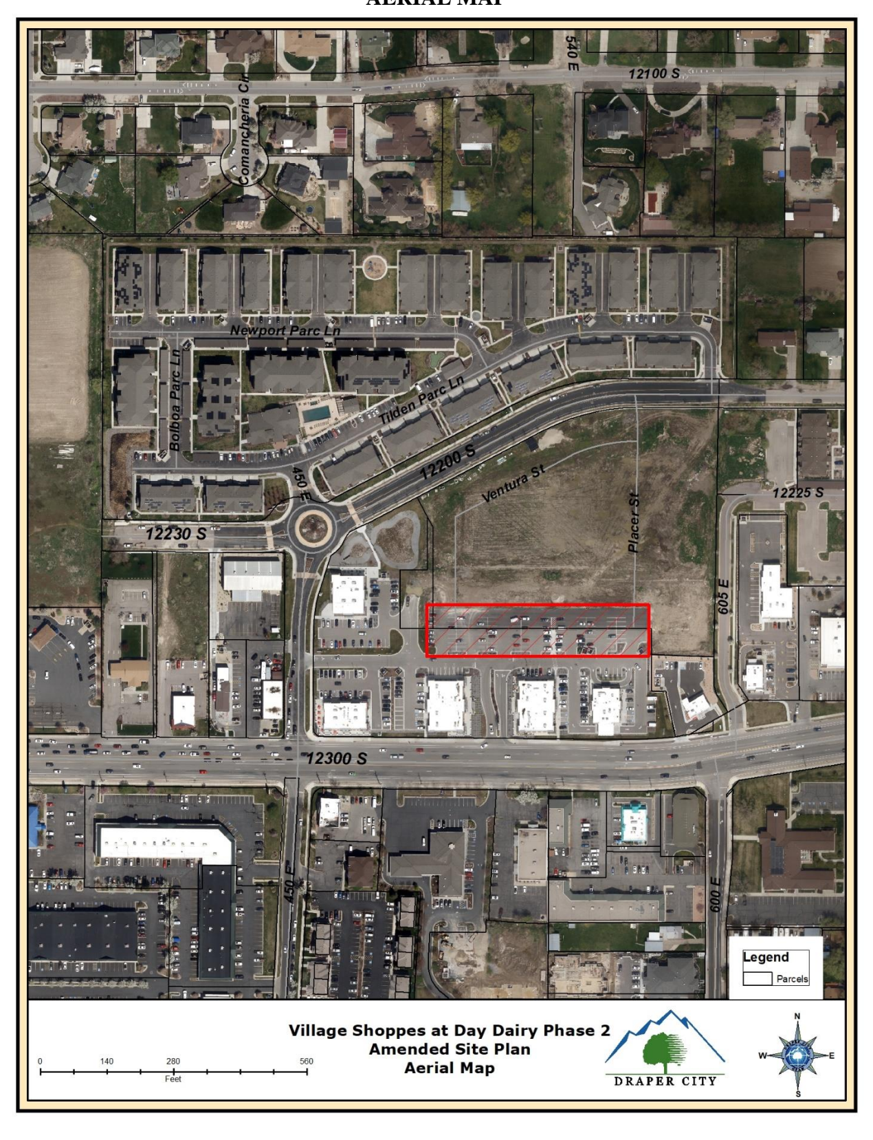
EXHIBIT B AERIAL MAP