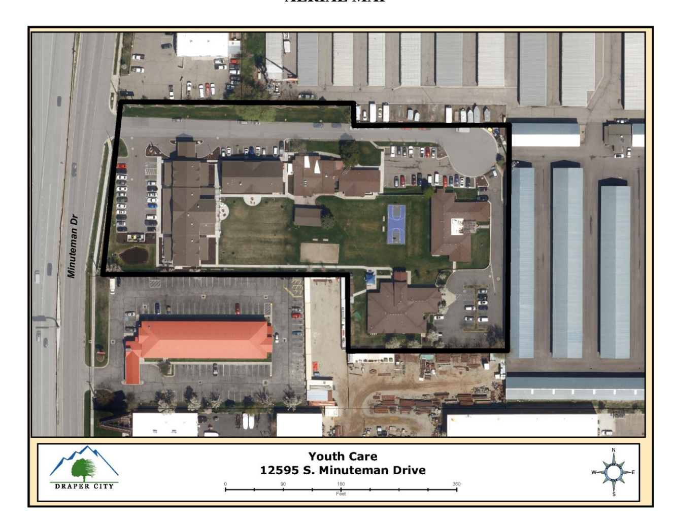
EXHIBIT B AERIAL MAP