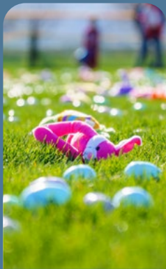
Easter Egg Hunt 10:00 AM April 4