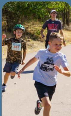
Tiny Tot Triathlon 9:30 AM - 12:30 PM June 13