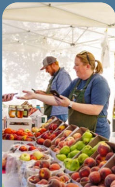
Farmers Market 5:00 - 9:00 PM July - October