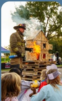
Fire Prevention Night 5:00 - 8:00 PM October 5