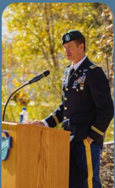
Veterans Day Ceremony 11:00 AM November 11