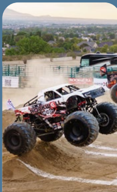
Monster Trucks! 7:30 PM August 14 - 15