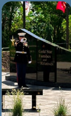
Memorial Day Ceremony 3:00 PM May 25