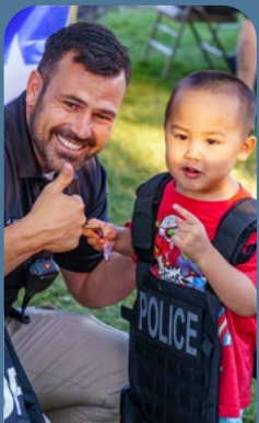
Safety Day 6:00 - 8:00 PM August 4