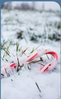
Candy Cane Hunt 4:00 PM December 7

All dates and times are subject to change — for full event details, including dates, times, locations, and vendor application information (if applicable), visit draperutah.gov/events