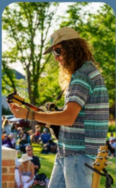
Concerts in the Park 7:00 PM June 3, 10, 17, 24