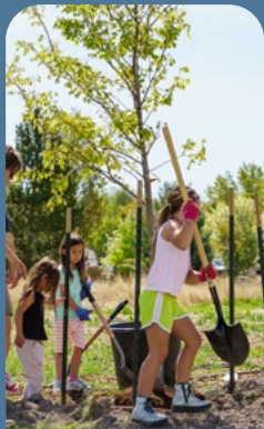
Arbor Day 10:00 AM April 24