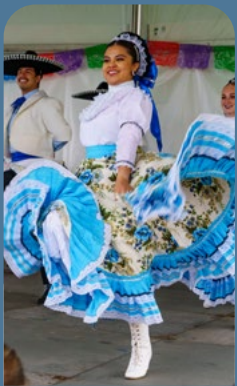
Cinco de Mayo 6:00 - 8:00 PM May 5