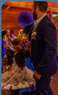
Daddy Daughter Dance 6:00 - 8:00 PM February 20

We look forward to seeing you throughout the year.