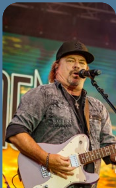
Draper Days Times Vary July 10 -18