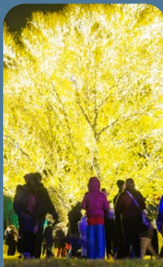
Tree Lighting Ceremony 6:00 - 8:00 PM November 30