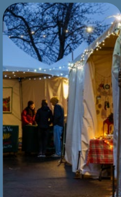
Holiday Market December 4 - 5