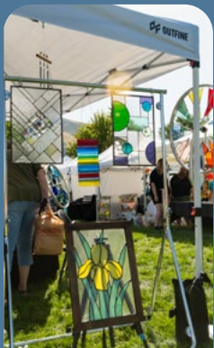
Int. Arts & Crafts Festival 10:00 AM - 4:00 PM September 12