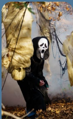
Haunted Trail 4:30 - 10:00 PM October 15 - 17