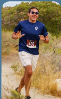
Corner Canyon Half Marathon 7:00 AM September 19