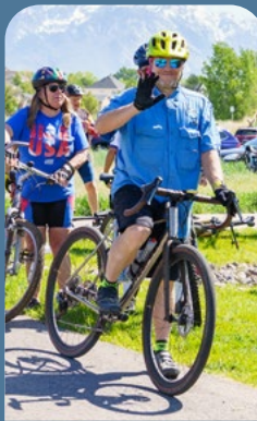
Mayor’s Bike Ride 10:00 AM May 9