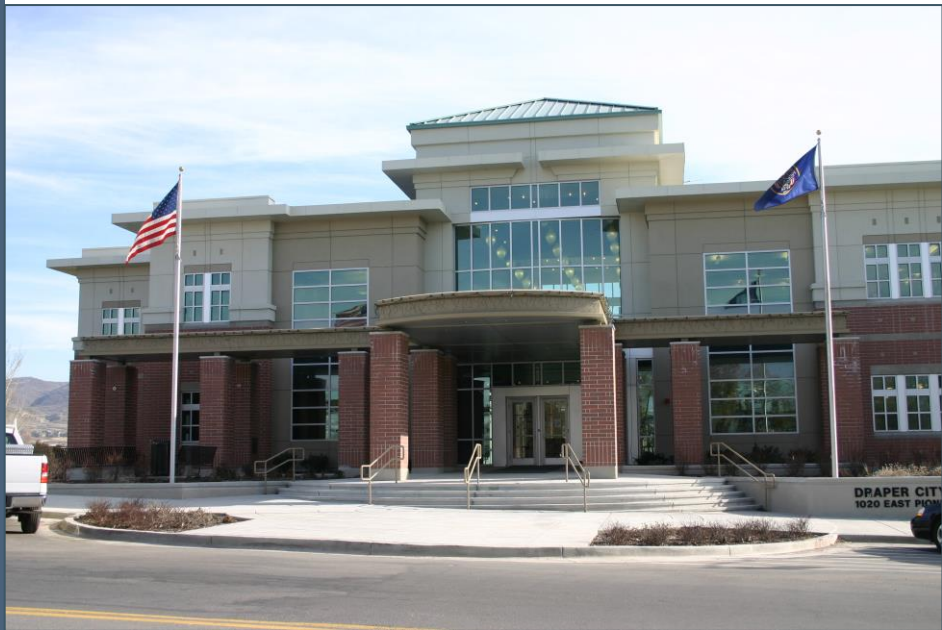
Draper City Hall (2011)

For Fiscal Year Ended June 30, 2020 CITY OF DRAPER, UTAH