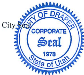
Rachelle Conner, MMC City Recorder Draper City, State of Utah

Posted: October 4, 2013, through October 23, 2013